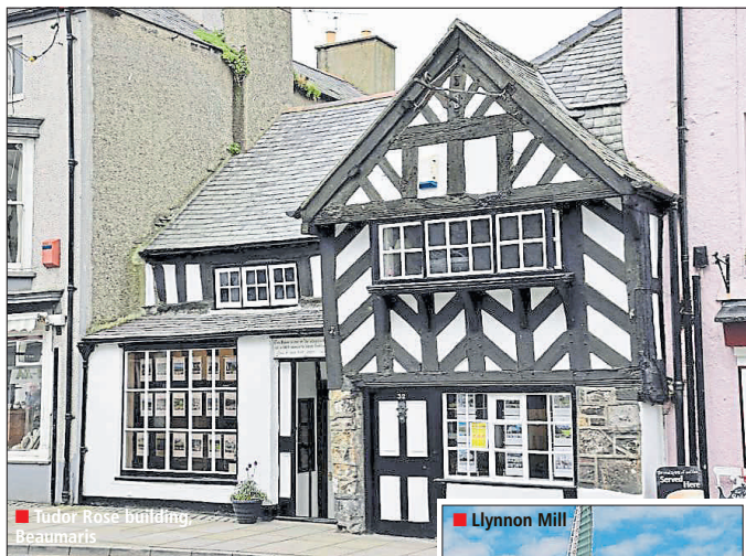
Tudor Rose building, Beaumaris